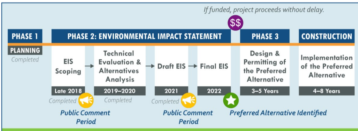
Long-Term Management Planning Process

Construction would begin following design and permitting, and once funding is secured. If there are no delays in this process, project construction could begin as early as 2028. Project construction could last 4 to 8 years, depending on the alternative. View the Draft EIS for more detail on this and the approach to evaluate potential shared funding and governance for the Preferred Alternative.